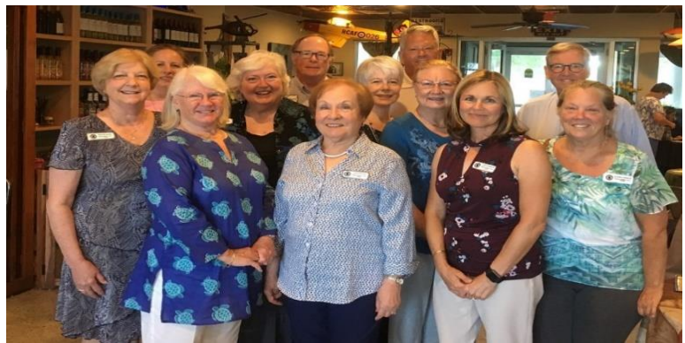
New Members 2018