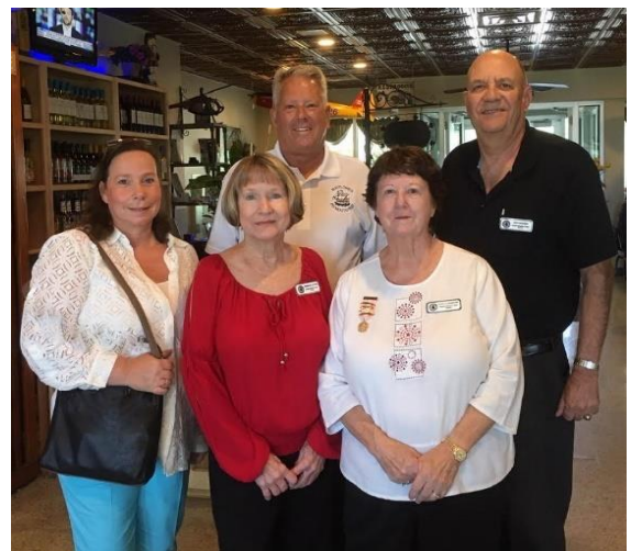
New Members and Supplementals 2017