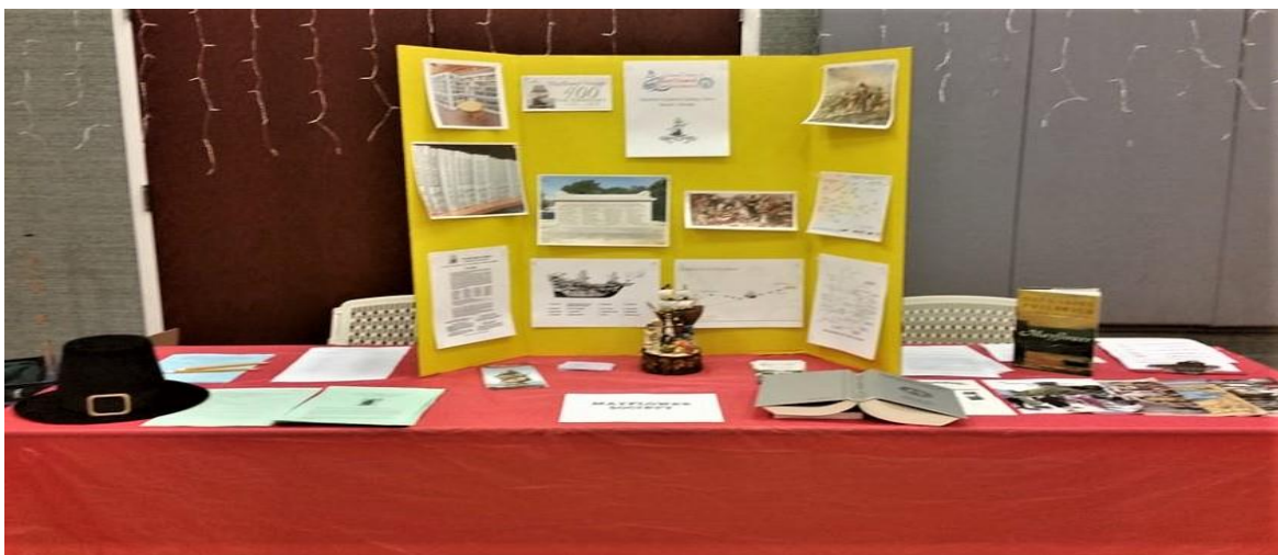
Stephen Hopkins Colony table at the Conference