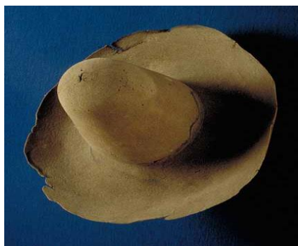
Constance Hopkins Hat

The Stephen Hopkins Colony Serves the Treasure and Space Coasts of Florida, which includes Brevard, Indian River, St. Lucie, Okeechobee and Martin Counties