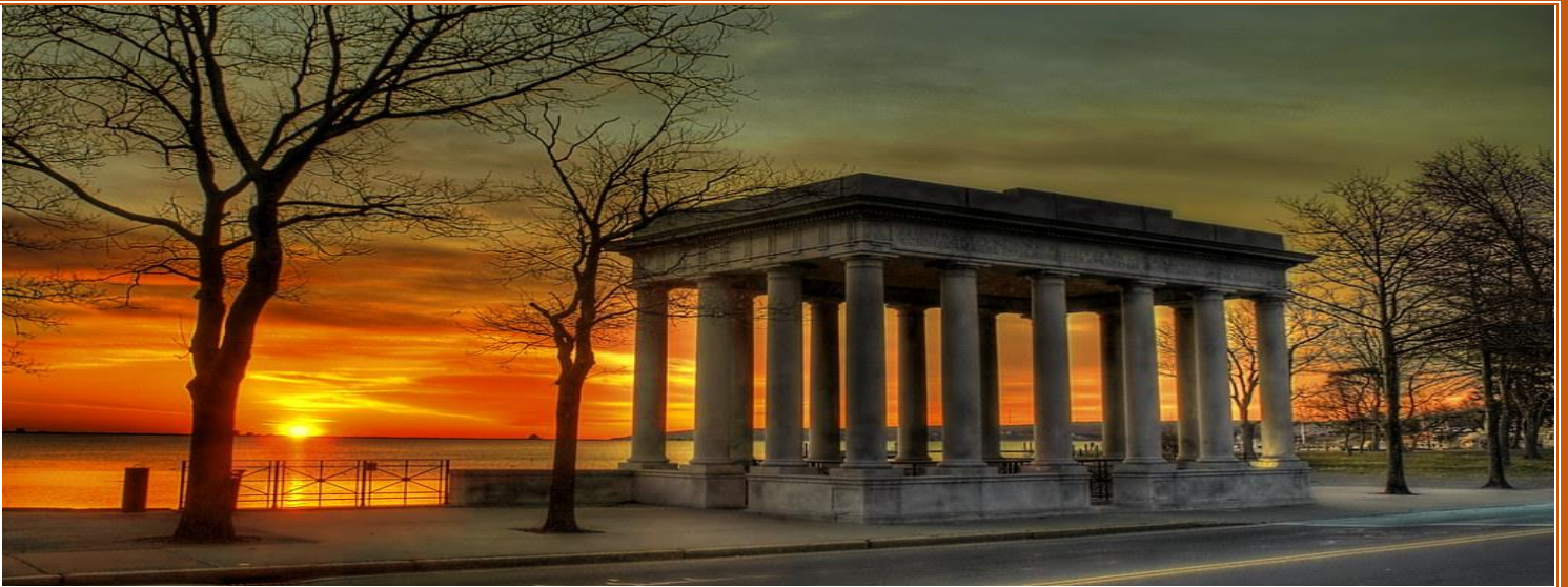
Plymouth Rock Portico

In the state of Florida Newsletter October 2019