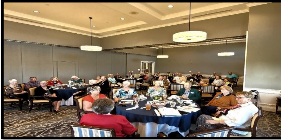
Stephen Hopkins Luncheon 2/6/20223 Pointe West Country Club, Vero beach

The Stephen Hopkins Colony serves the Treasure and Space Coasts of Florida, which includes. Brevard, Indian River, St. Lucie, Okeechobee, and Martin Counties